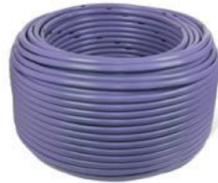
Available in Purple for Non-Potable water