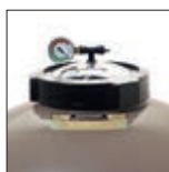
180 mm diameter threaded opening for simpler maintenance operations