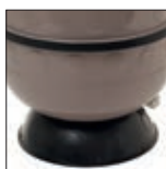
Circular base for perfect filter stability