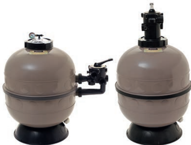
ProSeries™ HI Side