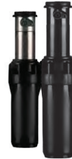
I-25-04 Overall height: 20 cm Pop-up height: 10 cm Exposed diameter: 5 cm Inlet size: 1" BSP