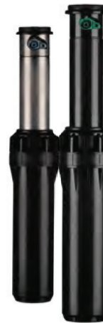
I-25-06 Overall height: 26 cm Pop-up height: 15 cm Exposed diameter: 5 cm Inlet size: 1" BSP