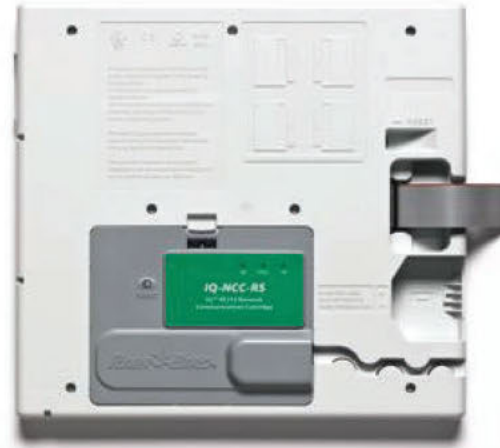
LX Series Cartridge Panel with IQ-NCC-RS Cartridge Installed