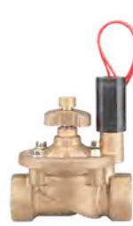
IBV-101G-FS Inlet diameter: 1" (25 mm) Height: 14 cm Length: 12 cm Width: 8 cm

* Accu Sync product information on page 94