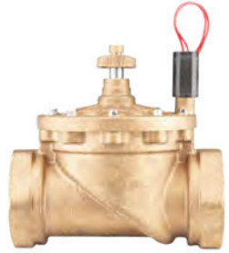
IBV-301G-FS Inlet diameter: 3" (80 mm) Height: 23 cm Length: 22 cm Width: 18 cm