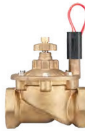
IBV-201G-FS Inlet diameter: 2" (50 mm) Height: 18 cm Length: 15 cm Width: 15 cm