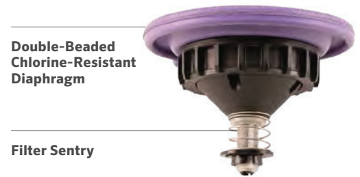
Double-Beaded Chlorine-Resistant Diaphragm