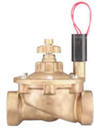
IBV-151G-FS Inlet diameter: 1½" (40 mm) Height: 17 cm Length: 15 cm Width: 15 cm