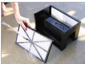
Easy-to-clean filter cartridge