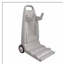
Premium Caddy Cart Model: RC99385