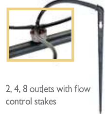
2, 4, 8 outlets with flow control stakes