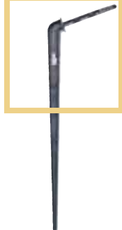
Catalog no. 802850