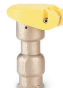
3-RC, 5-RC, 5-LRC