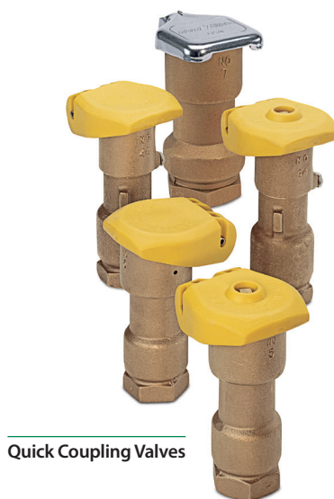
Quick Coupling Valves