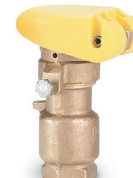
33-DRC, 33-DLRC, 44-RC, 44-LRC