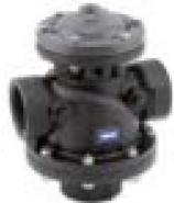
2" x 2"