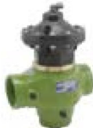
Victaulic 3" x 2"